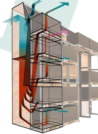
Extracted air heated and or dehydrated passes through each box individually.