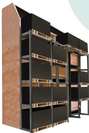
Boxes placed in scaffolding in front of drying installation. Box can be placed or taken one's ready.