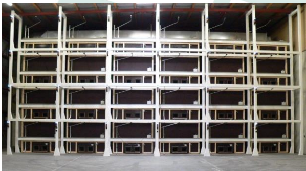
Example installation without boxes