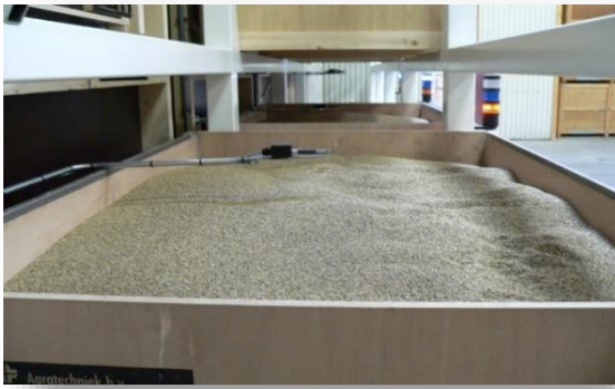
Measuring air out of seed per box to control.