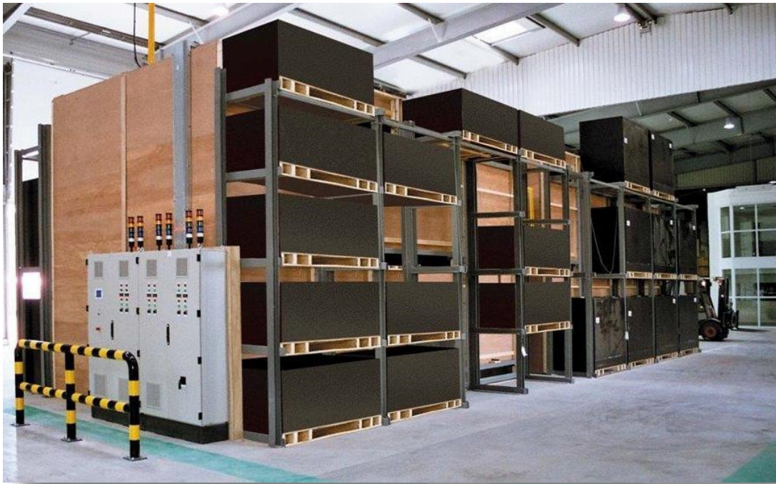
Drying each box individually to the desired moisture content of the seed.