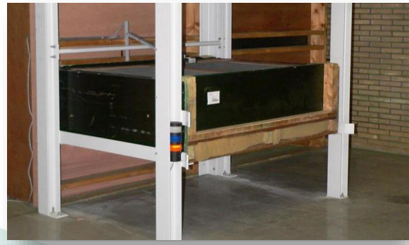
LED-lamps for indication status of drying.