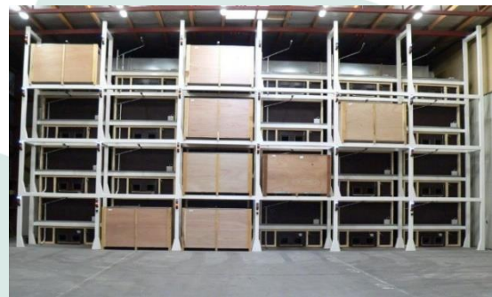
Installation partly filled with boxes