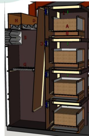
Drying of an individually box starts when placed in scaffolding and stops automatically when the seed is dry.